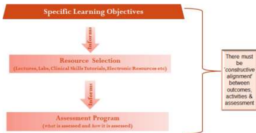
Figure 1: Constructive alignment informs the logic of the curriculum framework